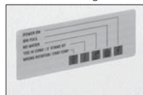
SS AISI 304